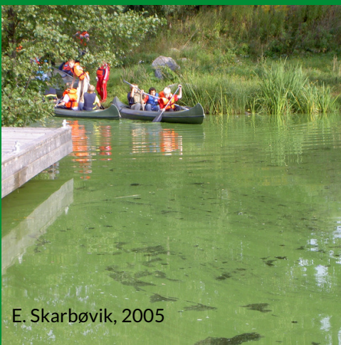
E. Skarbøvik, 2005